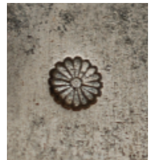
The chrysanthemum can be found in two different sizes, 5.5 mm and 3.1 mm, either on the crossguard or the base of the blade.