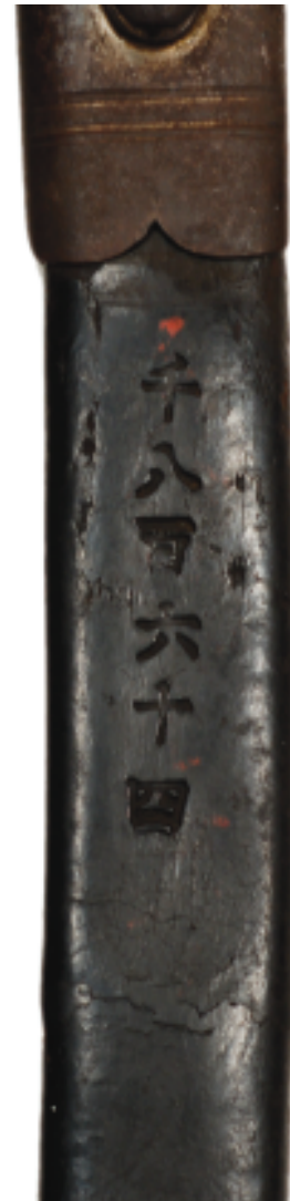
Two scabbards found with kanji on the front, one with a capture tag remaining. The left one translates to: 951, right one; 1864.

This is a variety of foreign arsenals found on Japanese bayonets that were sold to or made for Japan. A few of the known: Felix, Weyersberg, A & A.S. (August & Albert Schnitzler), Kirschbaum, F.H. (Friedrich Herder), Leige (Dutch), P.D.L. (Paul D. Lünenschloss) and H & Co.